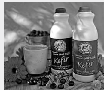
Redwood Hill’s goat milk kefir is cultured with ten live and active kefir cultures. Enzyme and probiotic-rich kefir strengthens the immune system and promotes digestive health. Redwood Hill’s version contains no sugar, artificial coloring or preservatives.